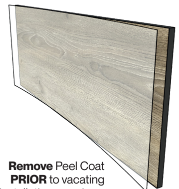
Remove Peel Coat PRIOR to vacating installation premises.