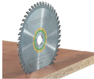
Festool 496309 blade or Aluminum/Plastic saw blade equivalent