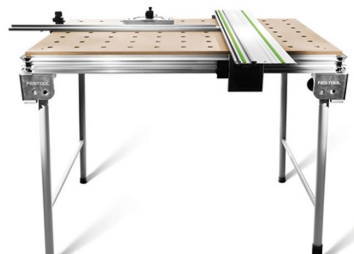
Set up guide rails, and support panel on appropriate supports