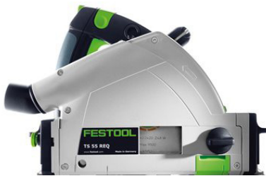
Festool 55 REQ Plunge Cut Track Saw or equivalent