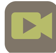
View Panel Field Fabrication video at na.abetlaminati.com